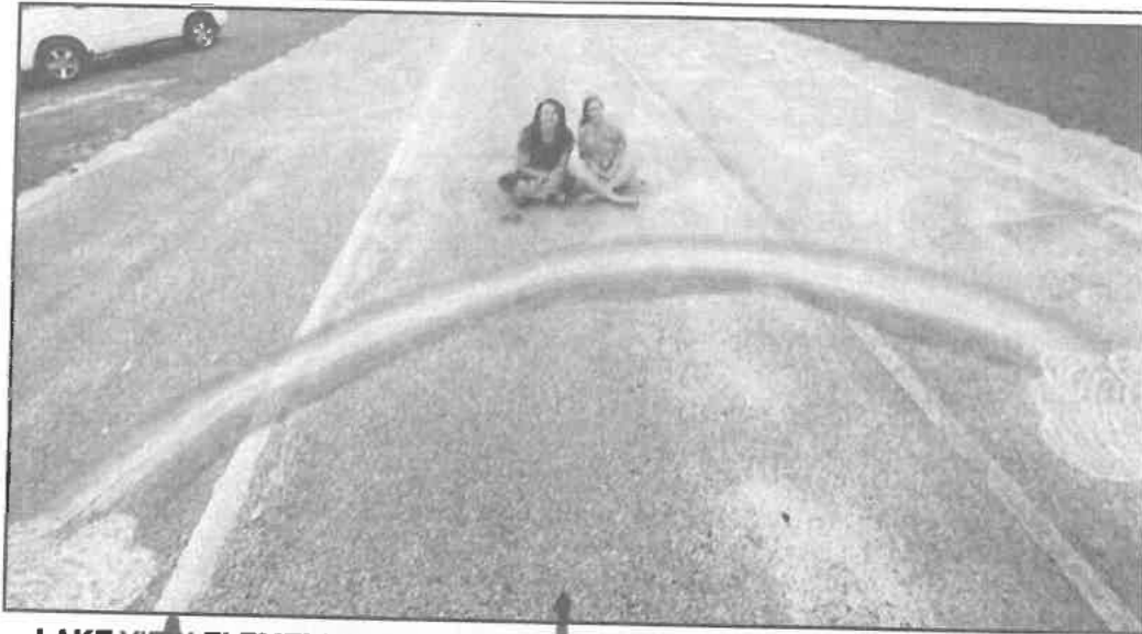
LAKE VIEW ELEMENTARY teachers are spreading love and cheer for their students during their distant learning time. STAY LAKE VIEW ELEMENTARY STRONG. The teachers are April Buffington and Sarah Lane, 1st grade. Shown are some pictures expressing the LVES spirit.