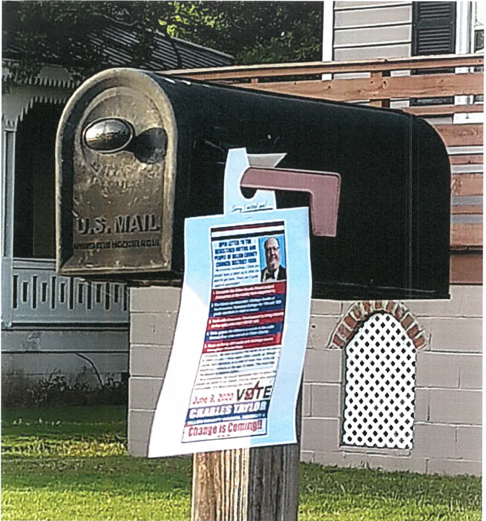
The flyer he posted illegally on mailboxes