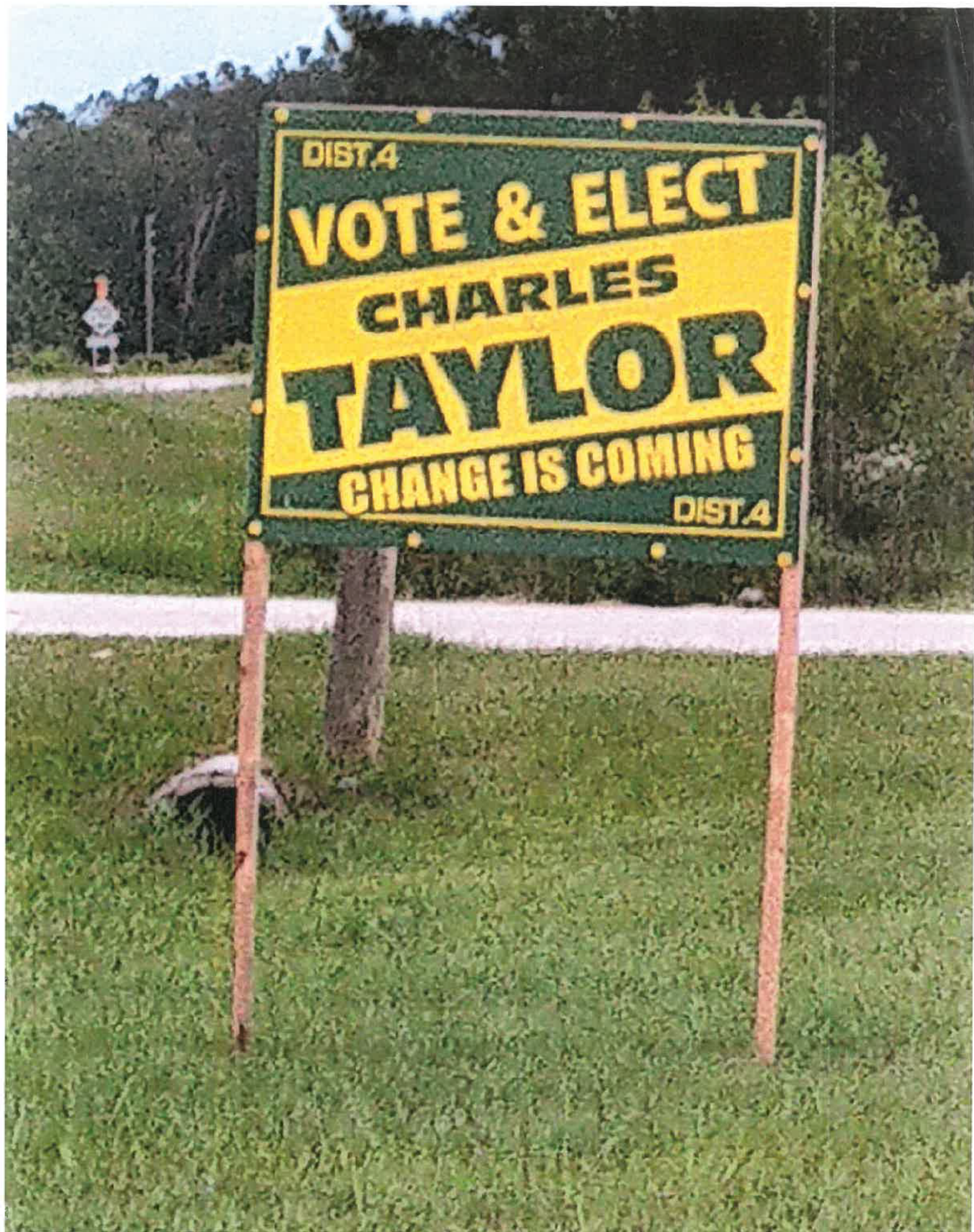
A picture of one of his large signs